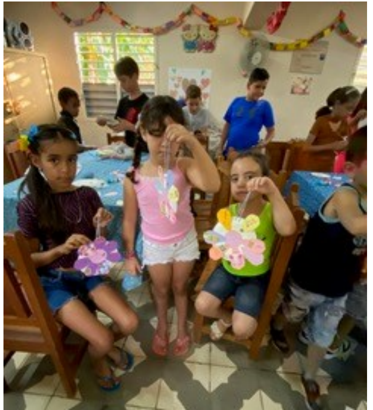
Children at Iguará and Meneses churches with the craft activity and enjoying lunch.